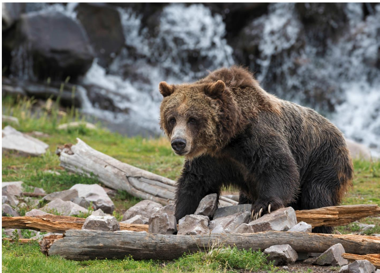
A grizzly bear at Yellowstone