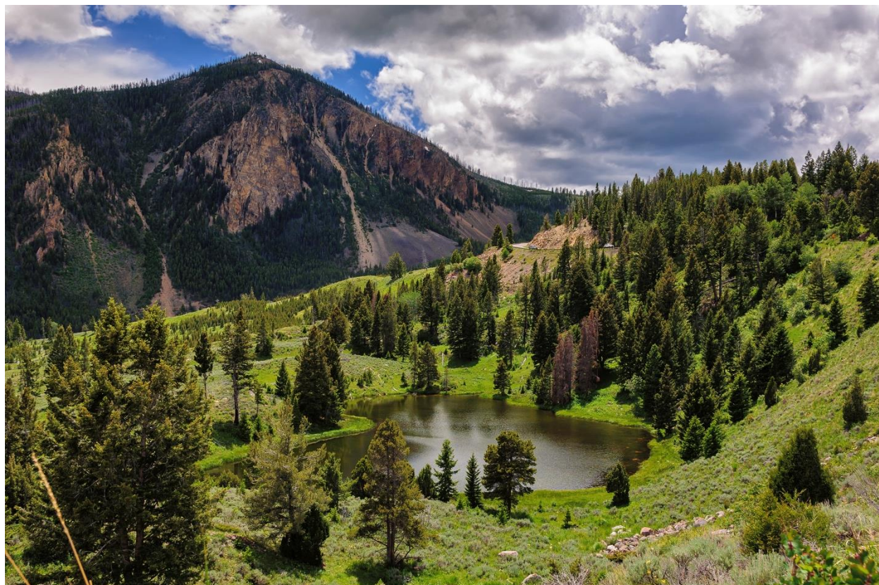
A view of the mountains at Yellowstone