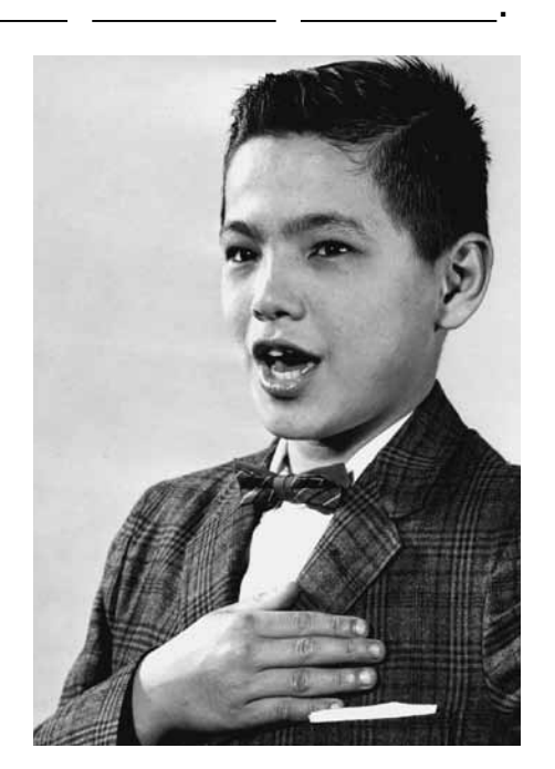
A young boy saying the Pledge of Allegiance at a naturalization ceremony in 1962.