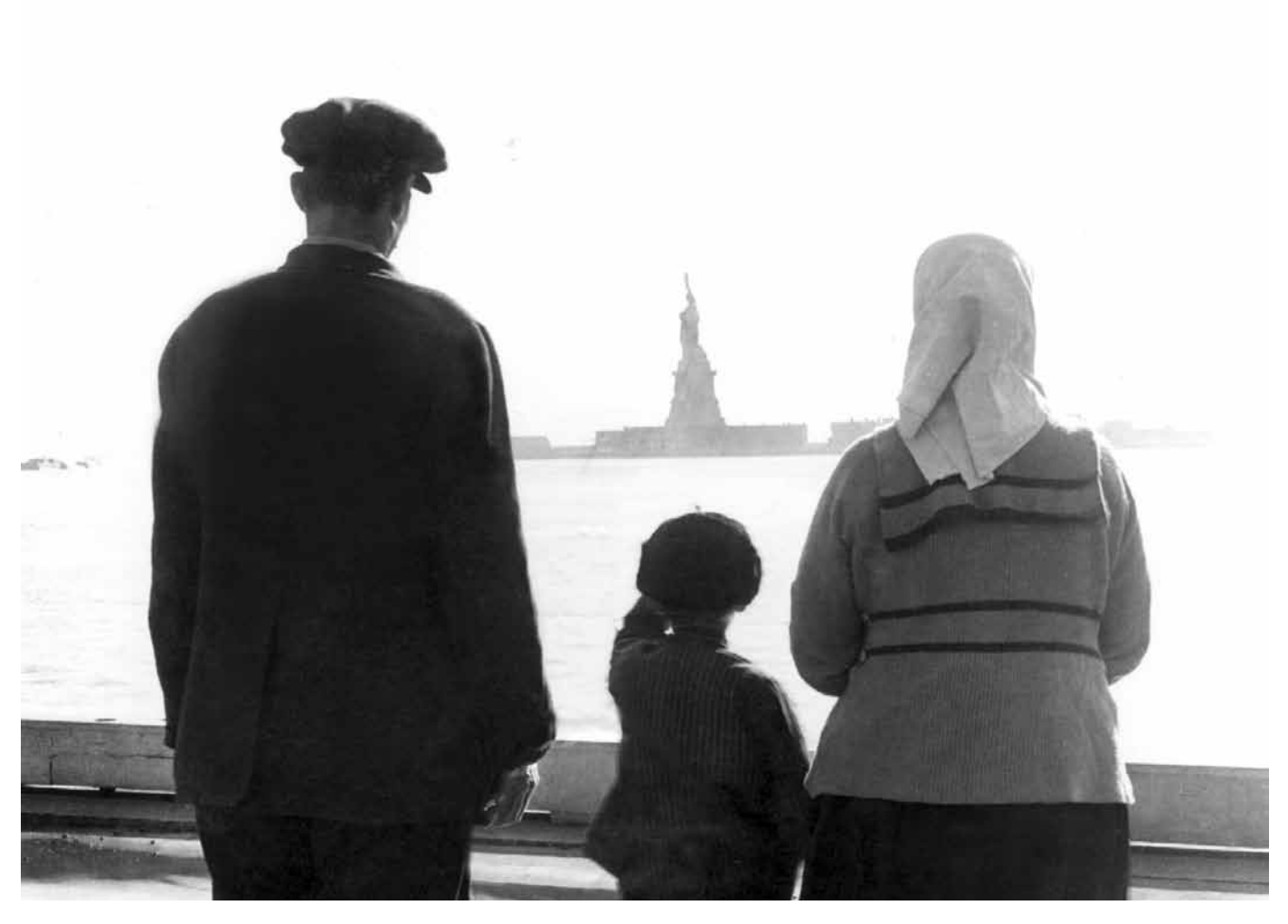
An immigrant family looking at the Statue of Liberty in New York Harbor.

Today, the Statue of Liberty is a symbol of freedom and democracy.